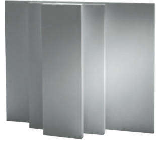
SKAMOTEC 225 building boards can easily be cut into any shape and size.